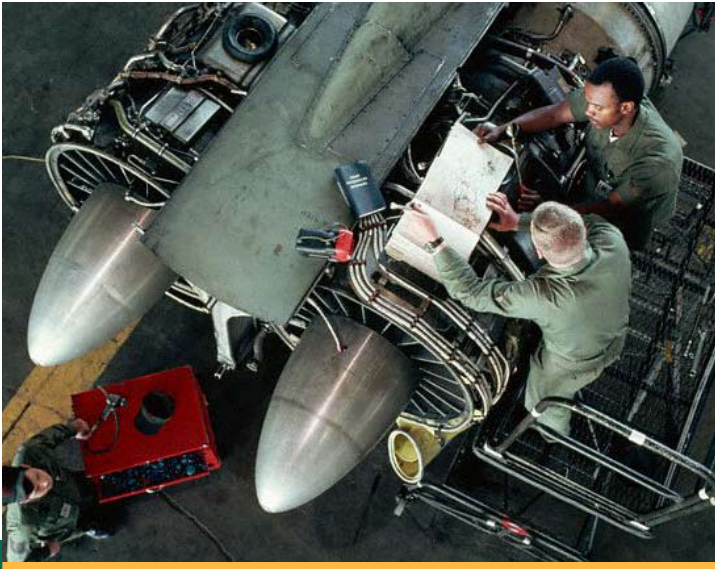
PBL has enabled the military to improve the efficiency of its weaponry repair systems.

for $50.00 or more), it will come as no surprise that software companies are notorious for holding too much inventory. Moreover, because of frequent revisions and bug fixes, software companies often face potential inventory write-offs amounting to tens of millions of dollars.