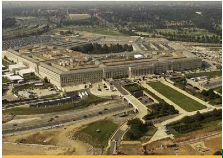
The Pentagon is PBL’s biggest fan.

Under this type of agreement, ABC 3PL gets paid more, the worse the supply chain performs. If Whiz Bang has forecasted too much, ABC 3PL will make more money by storing the excess inventory. And they will be paid a scrap fee to destroy the product when it becomes obsolete. Alternatively, if